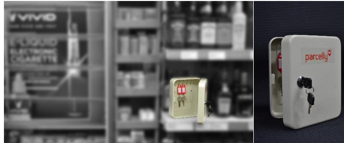
Secure Parcellly Key Exchange Locker (placed behind location counter)